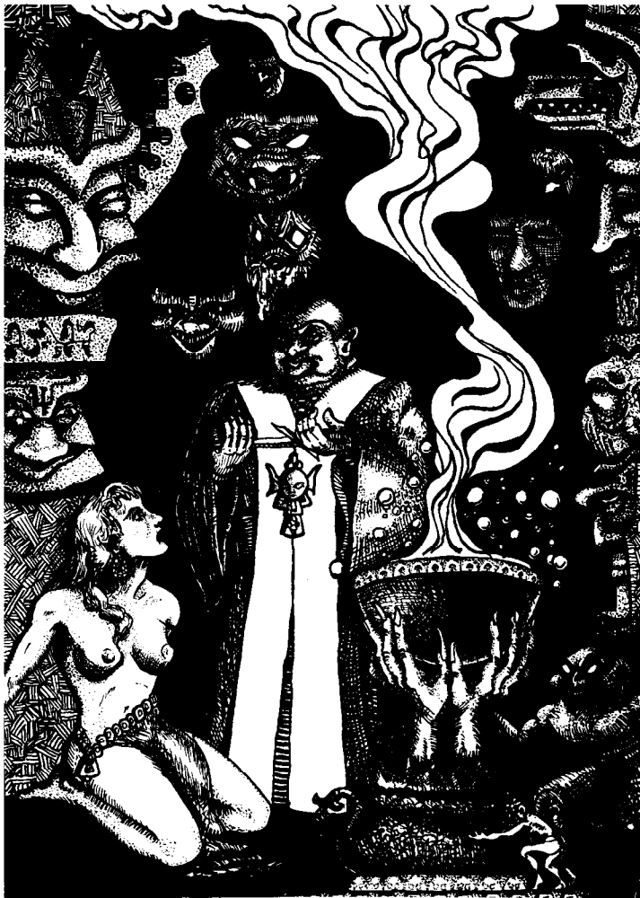
"A High Priest of Durrillamish preparing to offer up sacrifice." He has removed his grey corpse-like face paint as a sign that he now stands before the Reality of Evil, and he has put on the "Drymial," the surcoat of special devotion and sacrifice."

Illustration by the author from Empire of the Petal Throne